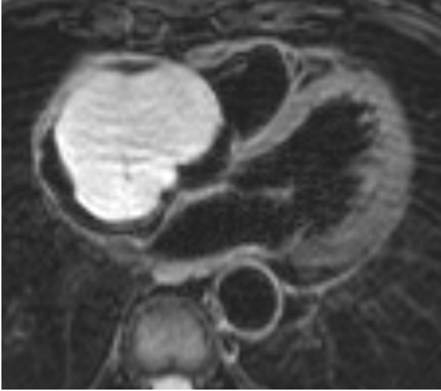
Figure 2. Axial T2 dark blood image showing the mass expanding the right atrium and abutting the tricuspid valve leaflets.