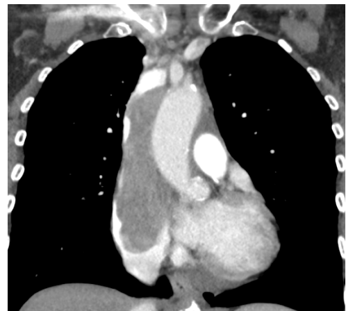
Figure 1. Contrast enhanced CT scan coronal reformat image showing extension of mass from the right atrium to the superior vena cava.

Following multidisciplinary discussion it was decided that the patient would not be suitable for surgery and the optimal management option was for a short course of steroids and radiotherapy with prophylactic anticoagulation. Following radiotherapy her symptoms were markedly improved with associated reduction in thymoma size on CT scan. The patient is currently being observed with repeat CT scanning.