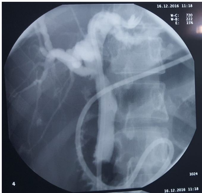
Figure 2. Cholangiogram done at 48 hours through the nasobiliary drain, after removal of stents.

Subsequent cholangiogram didn't show waist formation at the site of stricture, then a naso-biliary drain was inserted. Naso-biliary drain was kept for 48 hours and repeat cholangiogram was done, and it didn't show any evidence of re-stricture. Patient is currently on 3 monthly follow up with ultrasonography and LFT s. at the end of 6 months there is no evidence of re-stricture (Figure 2).