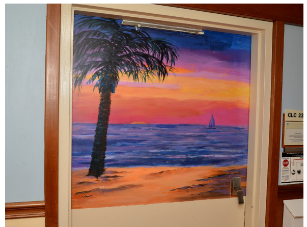
Figure 9. Tropical sunset.

them and asked them to tell her more about their door painting (if there was a painting already on the door). Often, they couldn’t tell the artist what was on the door. Or, if they did not like the painting, the artist informed them that they could help her design a new painting. In most instances they expressed surprise—even astonishment. “What, are you kidding me? I get to say what goes on the door?” “After getting one request for a nude woman or woman in a bikini, artists learned to reply, “Within certain limits, yes.” When reactions were, “I don’t care,