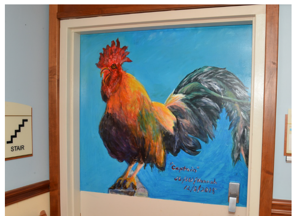
Figure 10. Captain roster.