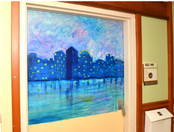
Figure 6. Miami starry night.