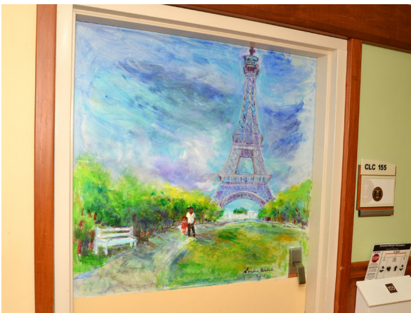
Figure 7. Daughter and dad in Paris.