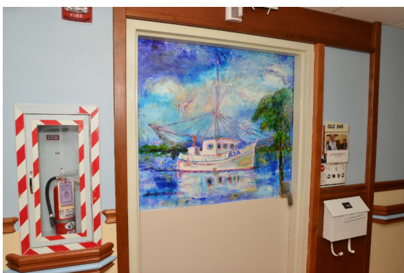
Figure 1. Aida.