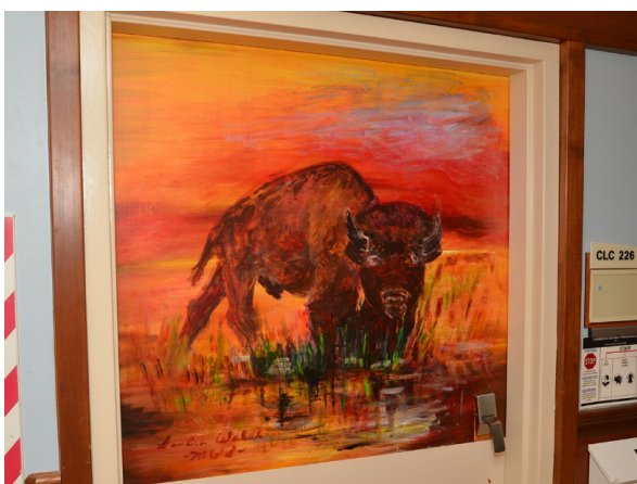
Figure 2. The buffalo.

doors (83%) in one year. All artists that were introduced to the project continued to paint doors intermittently throughout the year as their schedules permitted. Ten paintings remained untouched because those doors were staff favorites or were signed by previous artists. Painting completion time ranged from 1-12 hours depending on each artist’s style, if the painting was new or enhanced, and the number of requests for change made during the painting process.