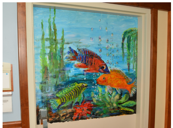
Figure 5. Tropical fish colors.