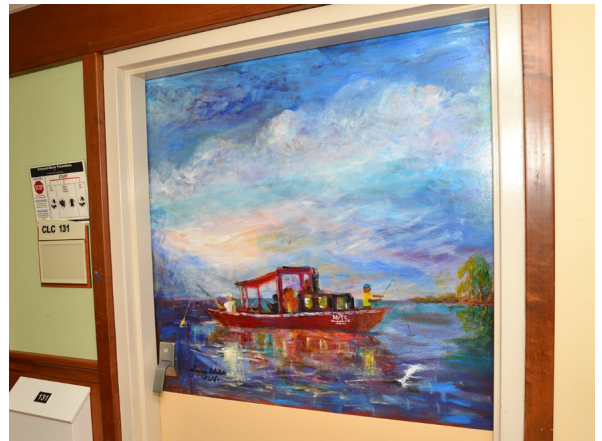
Figure 3. The pact.

The DPI project was completed in one year. The artist/researcher discovered that she could not only paint with acrylics but also that she could provide comfort [3] for herself and others through the DPI. Initially, she planned to paint a few doors. However, after four paintings were completed, she found that she was comforted by the socialization with participants and enjoyed the environment. She thought other artists were needed, might enjoy the project, and that they too would find comfort during implementation of the DPI. Five additional artists were recruited. Six artists completed 50 door paintings out of 60