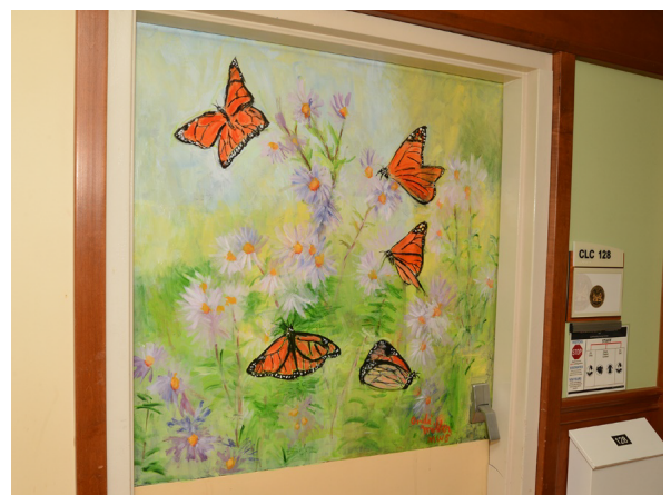
Figure 11. Butterflies and flowers.