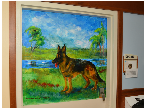
Figure 4. My dog Togoh.