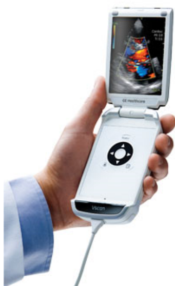
Figure 1. Hand-held Ultrasound Machine, contains an image of a portable hand-held ultrasound machine that is one of many types of ultrasound machines that can be used to perform POCUS examinations

One of the current trends within the ultrasound industry is Point of Care Ultrasound. Point of Care Ultrasound or POCUS allows medical professionals to quickly assess specific parts of a patient. POCUS was created to help with assisting medical professionals to swiftly look at specific body parts that may be the cause of specific symptoms that are occurring within a patient. The convenience of POCUS being utilized next to patient bedside has resulted in many health facilities utilizing this procedure. Figure 1 lists a summary of the benefits of POCUS focused patient care. Note that POCUS allows reduced costs, increased patient care outcomes, and it can be performed next to a patient ("The benefits of point," 2011). The subsequent paragraphs will define what Point of Care Ultrasound is while discussing various applications of POCUS (Table 1).