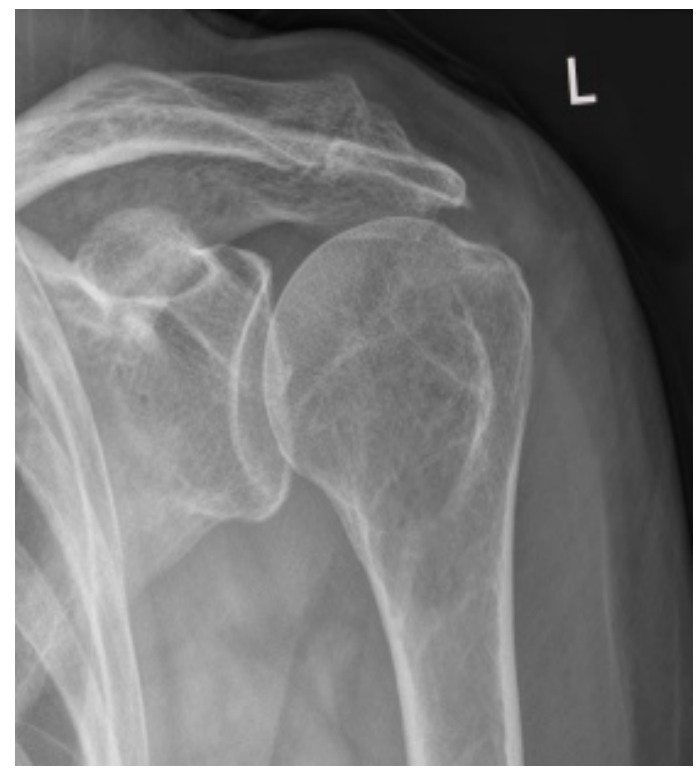
Figure 1. X-ray of left shoulder

The patient was seen two times per week in physical therapy for six weeks. The treatment was designed to three phases two weeks in