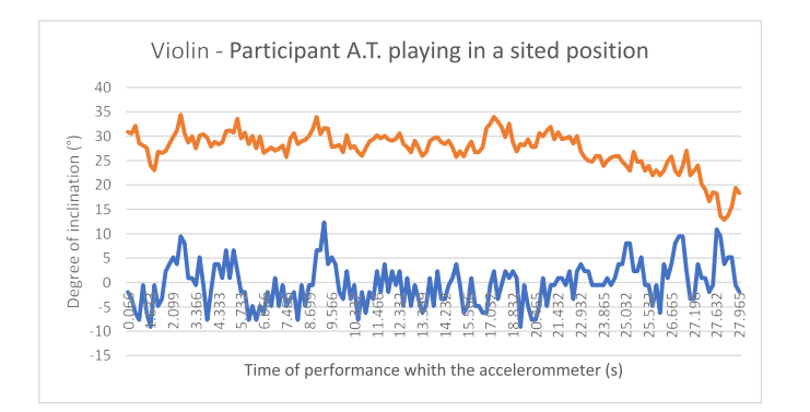
Figure 2. Represents the linear graphic obtained after processing the signal captured from the accelerometer with the program ZSTAR Graphical User Interface®