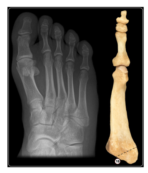
Figure 4. X-ray of a Type-1b fracture and correlation in bone model: fracture involving the middle one-third metatarsal-cuboid joint

First, clinical information, included complications, after early evaluation at a 4 to 6 weeks period was obtained for each participant. Second, at the time of this study, a phone contact was attempted for all patients, and a follow-up appointment was fixed. Patients who returned were examined by the second investigator (G.d.G), and clinical results were measured using the AOFAS Midfoot score [1]. Clinical healing