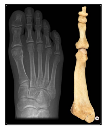
Figure 3. X-ray of a Type-1a fracture and correlation in bone model: fracture involving the lateral one-third metatarsal-cuboid joint

Phys Med Rehabil Res, 2019 doi: 10.15761/PMRR.1000193 Volume 4(1): 2-6