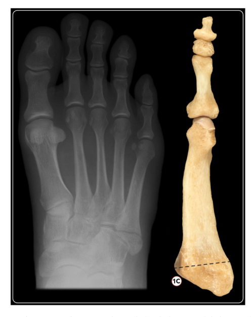
Figure 5. X-ray of a Type-1c fracture and correlation in bone model: fracture involving the medial one third metatarsal-cuboid joint