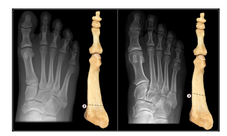
Figure 6. X-rays of Type-2 and Type-3 fractures and correlation in bone models: Type-2 (left): fractures at the junction between the proximal diaphysis and metaphysis of the fifth metatarsal (Jones fractures); Type-3 (right): fractures of the fifth metatarsal shaft (shaft stress fractures)

was defined as the absence of pinpoint tenderness on fracture site palpation and the patient's ability to bear weight on the involved foot without discomfort. Further, the following parameters were assessed: sport type and activity level (high level athletes training more than 14 hours per week; recreational athletes less than 14 hours per week), time until return to full weight bearing, to work and to sport activities.