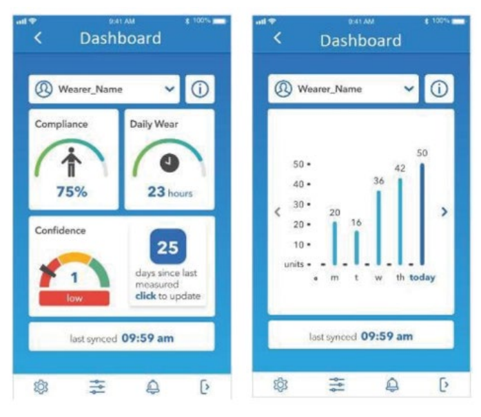
Figure 3. Individual belt wearer's Dashboard metrics