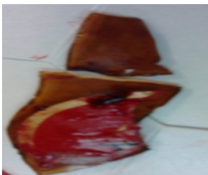
Figure 3. Broken bottle glass pieces with brand label still intact.