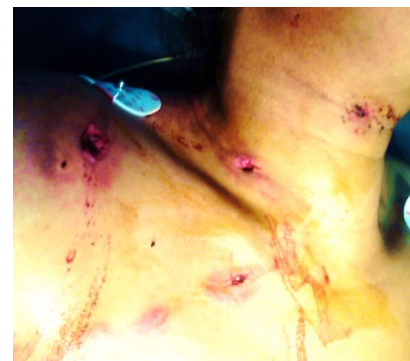
Figure 7. Penetrating wounds produced by the shotgun pellets.

The neck is a relatively small area of the human body, accounting for about 3% of the total body surface area, but it encases many vital structures of most major organs or systems including the cardiovascular, respiratory, neurologic, digestive and musculoskeletal systems. The neck is commonly divided into three anatomic regions or zones as described by Roon and Christensen [9]. Zone I is located