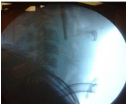
Figure 2. Post laryngeal repair X-ray-still showing the foreign body.