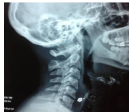
Figure 8. Check X-ray 3 weeks after surgery.