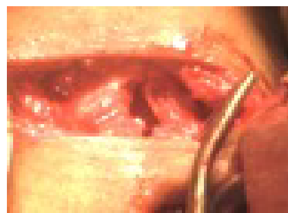
Figure 5. Laceration gap in the cricothyroid membrane.