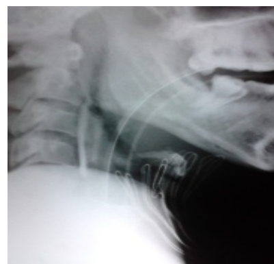
Figure 1. Preoperative X-ray showing the foreign body and endotracheal tube.

To facilitate surgical repair of the larynx, a tracheostomy was done and the endotracheal tube was removed. The larynx was repaired