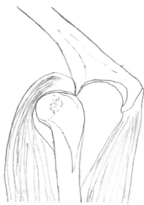
Figure 2. Anterior directed pressure applied to the posterior aspect of the olecranon results in passive extension of the elbow as the trochlea slides up the coronoid.

In our experience, our technique has been successful on occasions when techniques involving traction have failed in the emergency room. Standard traction manoeuvres increase the tension in the anterior structures and can hinder the reduction. We hypothesize that these tensions (and therefore the resistance to reduction) are much lower using our technique because the elbow is flexed and no traction is applied. We further hypothesize that the brachialis tendon may contribute to the ease with which a reduction is obtained with our technique: although an intact brachialis tendon may resist inline