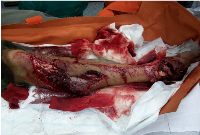
Figure 2. Open fractures of the lower limb associated with a catastrophic foot is often considered an indication for primary amputation

Ideally, these items should be quantified and integrate in a scale. Being so, once a cut-off point is reached, it should allow us to get a treatment recommendation. These scales should be friendly to use, endorsed by an accuracy of 100% with sensitivity and a specificity of 100%. However, the most widely used guides, MESS, LSI, PSI, NISSA, HFS-97 do not reach an agreement for the items of judgment to be included. So, we may observe that the load of contamination of the wound is only taken into account on the NISSA scales and HFS-97. That is also the case of the shock, it is not included in the LSI or PSI scale and, on the other hand, the observation of neurologic injury is included. In the case of the MESS scale, the span of time from the moment of the injury and the beginning of the treatment is not taken into consideration.