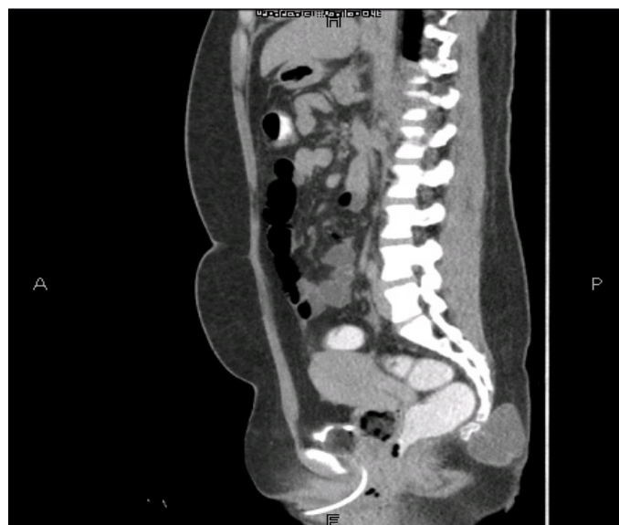
Figure 2. Sagittal section showing linear hypoattenuating track in continuation with the endometrial canal and extending up to the fundus and reaching up to the serosal lining representing focal site of perforation

*Correspondence to: Roger Christopher Gill, Trauma Fellow, The Aga Khan University Hospital Karachi, Pakistan, E-mail: roger.gill@aku.edu