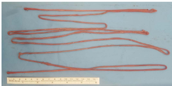
Figure 5. Serosa lifted to show how it appeared like a ribbon. Seen also is a large part of the small bowel devoid of serosal lining