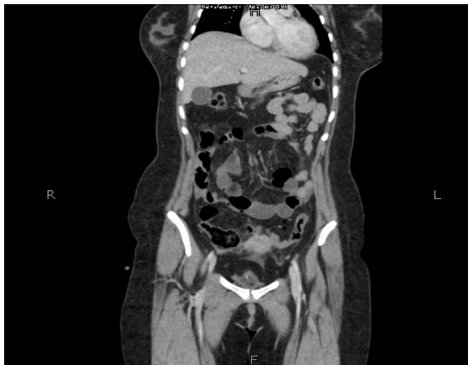
Figure 3. Minimal free specks of air seen within the peritoneum in pelvis and paramedian region