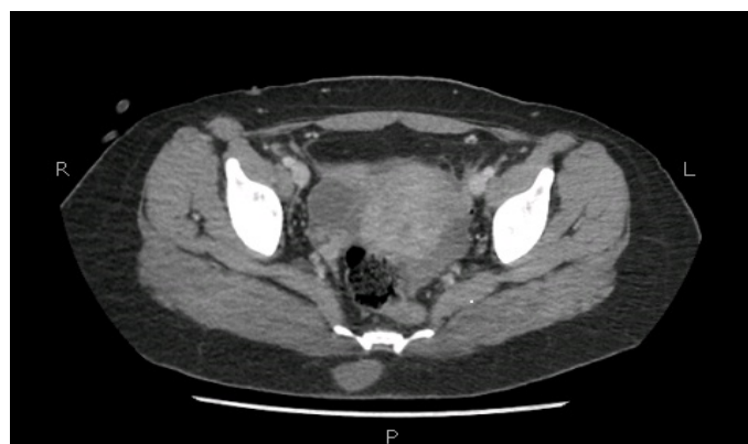
Figure 1. Free fluid within the pelvis, right iliac fossa and extending up to the right paracolic gutter. Minimal free specks of air seen within the peritoneum in pelvis and paraumbilical region

Post operatively, the patient was transferred to a high dependency unit, where she remained hemodynamically stable and was shifted to general ward on postoperative Day 3. Following an uneventful recovery, she was discharged on postoperative day 6.