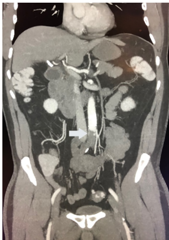
Figure 1. Contrast-enhanced coronal abdomen image demonstrates a large acute thrombus in descending aorta (arrow)

Because of the bilateral femoral cut down procedure, the right radial arterial access was used to place a 6Fr Neuro max (Pneumbra,