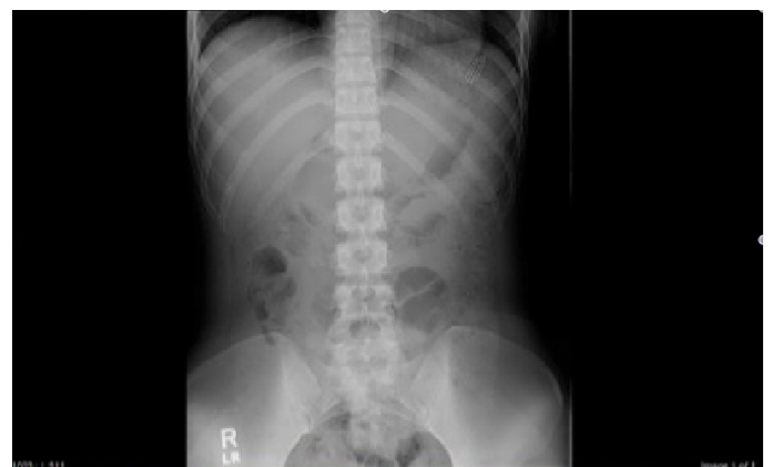
Figure 1. X-ray abdomen showing toothbrush bristles.

midnight using polypectomy snare and rat tooth forceps but this was unsuccessful due to inability to introduce the toothbrush into the esophagus. The toothbrush was visualized in the fundus in a pool of residual liquid and solid food material. The bristled end was facing the pylorus and therefore the snare was used to rotate the toothbrush so that the bristled end was now proximal. The snare was firmly on the bristles but the toothbrush did not traverse through the gastro-esophageal (GE) junction, despite different maneuvers including