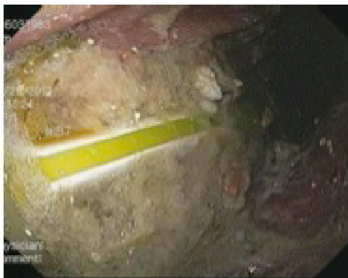
Figure 2. Toothbrush in stomach.