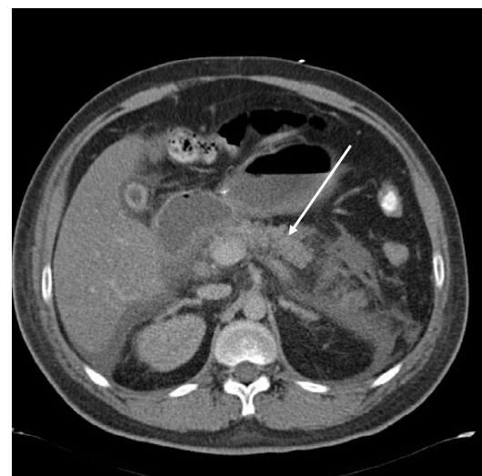
Figure 2. Abdominal CT- scan of the presented case (see text) showed edema of the pancreas (white arrow) suggestive for an acute pancreatitis.

To summarize, by assessing our patients' extreme metabolic disarrangements and acid-base disorder using the four different methods we were able to compare them and to judge their clinical applicability and diagnostic value. Figure 1 clearly demonstrates the changes in laboratory results as assessed by the different methods in the first day after treatment initiation. From this several statements may be derived. First, the traditional approach allowed the detection of the different components of the acid-base disturbances. The traditional method detects the accompanying metabolic alkalosis, as long as all the correct steps are followed. Second, the Stewart approach gives a good physiological insight, but one tends to focus on the strong ion gap (SIG), missing possible accompanying metabolic disorders (e.g. hypocholema). Another acknowledged drawback is its clinical applicability as it requires complex calculations. Third; Magder seems to give a complete picture of the probable causes of the acid-base disturbances. When critically reviewing the results from Magder, the shift in chloride-effect on the acid-base disorder is striking. Initially the chloride-effect was positive, contributing to an alkalinizing effect, while at our second time point the opposite was demonstrated with the