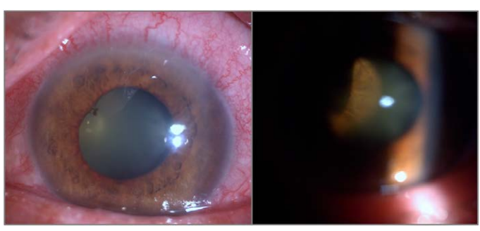
Figure 1. Conjuctival hyperemia, neovascularization of iris and a huge mass extending to anterior vitreous

Uveal melanoma is the most common primary intraocular tumor in adults originating from melanocytes located in iris, ciliary body and choroid [4]. Incidence of choroidal melanoma is 4,9 per million in US, 8 per million in Northern Europeand 2 per million in southern Europe