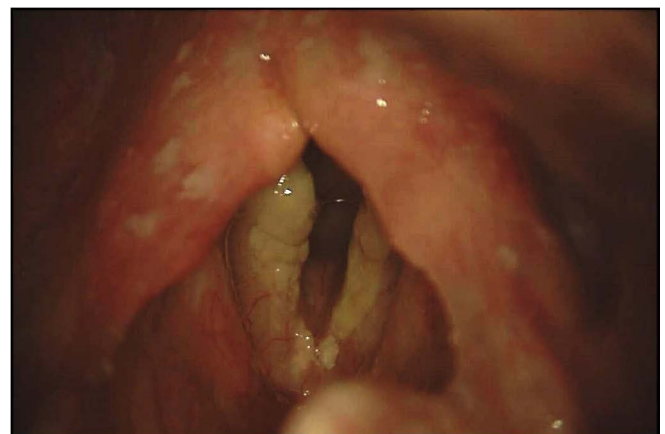
Figure 1. Laryngoscopic image revealing edematous arytenoids, aryepiglottic folds, false and true vocal cords with multiple superficial fibrinous exudate and slough like polypoidal lesion over both the true vocal cords.

tuberculosis of larynx was considered first. However, after obtaining informed consent, the patient was taken to the operating room for a direct microlaryngoscopy and biopsy to exclude malignancy. Under direct visualization, the epiglottis, supra-arytenoid tissues, true and false cords were edematous and polypoid in appearance covered with a fine fibrinous exudate with normal subglottis. Multiple biopsies were taken and sent for histopathologic examination, which revealed granulomatous inflammation with necrotising granulomas and psuedoepitheliomatous hyperplasia suggestive of tuberculosis (Figure 2). The patient was discharged on the anti-tubercular medications and asked for a follow- up appointment one month later with the culture report. Cultures of the biopsied tissue returned a diagnosis of