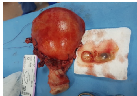
Figure 2. Obstetrical hysterectomy

that in such cases is hemorrhage, disseminated intravascular coagulation and shock. The clinical spectrum of disease vary from abdominal pain to shock. In our case, the patient had hypovolemic shock. Intraabdominal hemorrhage due to placenta percreta can mimick many conditions. The differential diagnosis includes intraabdominal solid organ rupturu (such as hepatic or splenic rupture), ovarian cyst rupture, heterotopic pregnancy.