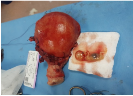
Figure 3. Obstetrical hysterectomy

Antenatal ultrasound is the technique of choice used to establish the diagnosis and guide clinical management as it is cost-effective and popular. If the ultrasound findings are suspicious or the placenta is located on the posterior wall, magnetic resonance imaging can be performed. It provides crucial information on the vascularization of the anatomic planes and of the degree of invasion, modifies the surgical strategy [6]. The differential diagnosis constitutes a particular challenge for clinician as massive blood can be life threatening to patient. In our case, ultrasonography performed in emergency department. But the diagnosis was confirmed in the peroperative period.