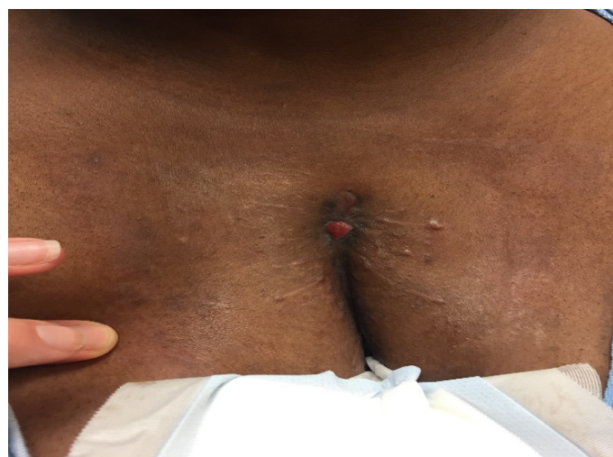
Figure 4. Sternal wound healed after prolonged treatment with V.A.C.™ system and antibiotics.