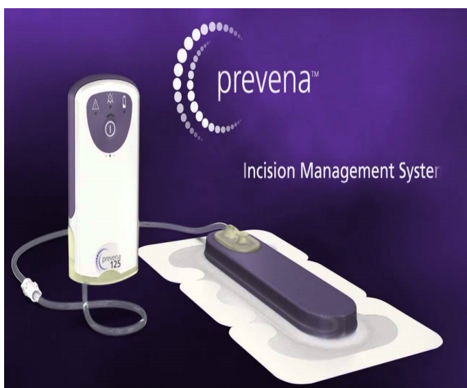
Figure 2. Prevena™ wound management system

sternal wound skin to absorb any secretions underneath. A culture of the discharge fluid was obtained at this time and showed no growth. Cultures from blood, urine and sputum were also negative for any growth. The initial impression was superficial fat necrosis.