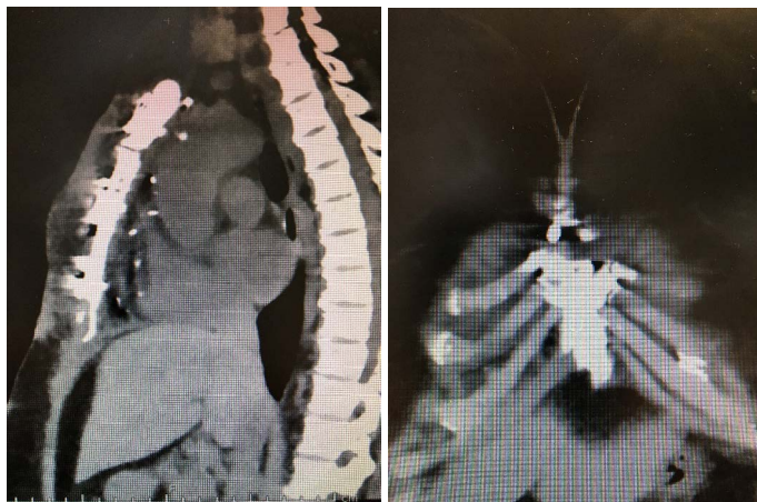
Figure 5. Saggital and Coronal sternal Computer Tomography following complete healing

9% [2]. It is often diagnosed clinically by the presence of erythema, drainage, fever and occasional ternal instability; low-grade fever may be the only presenting complaint. Superficial SWI is often treated with IV antibiotics and local wound care.