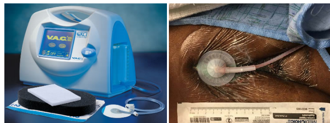
Figure 3. V.A.C.™ System and its clinical application in this case

Sternal wound infection is an uncommon outcome of cardiac surgery and is often divided into two categories: superficial and deep depending on the tissue involved. The superficial infections involve skin, sub-cutaneous tissue and the pectoralis fascia only without involvement of the bone. The incidence of superficial SWI is reported to range from 0.5-8% with a combined morbidity and mortality of 0.5-