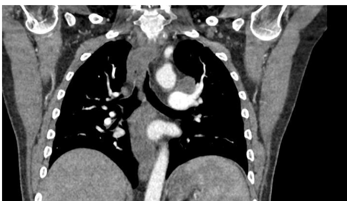
Figure 3. Ct scan of chest with IV contrast, coronal section showing enlarged mediastinal LN

Flow cytometry of the biopsy was negative for B-cell mono-clonality and T-cell aberrancy, ruling out a high-grade B-cell lymphoma. Microscopy was consistent with RCC and showed highly anaplastic cells with some nesting but no definite gland formation. The biopsy stained positive for markers most consistent with RCC (Table 1). An abdominal CT scan was suspicious but not conclusive for a primary site on both kidneys. Pre-donation and pre-transplant CT scans were reviewed, but no specific lesions were identified. The patient was diagnosed with metastatic high-grade RCC with an unknown primary site.