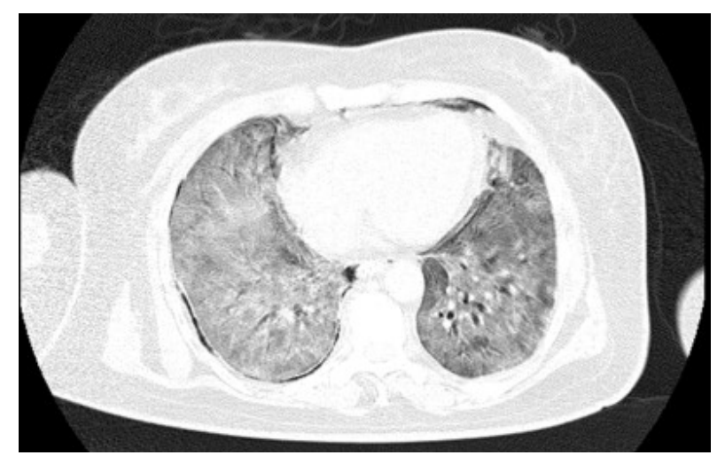
Figure 2. Tomography of the chest after ingestion of chlorine dioxide with images with a bilateral diffuse alveolar pattern