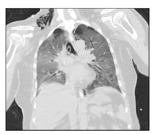
Figure 3. Chest tomography with the presence of air in the right supraclavicular area with increased density diffused throughout the lung parenchyma