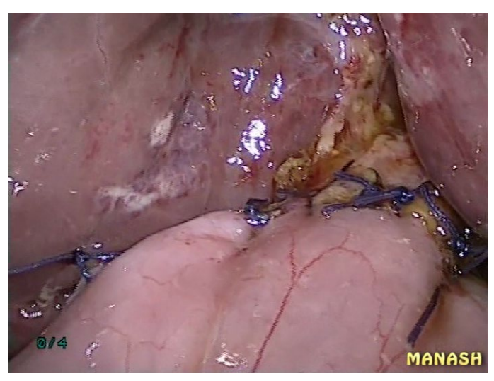
Figure 3. Completed hepaticojejunostomy.