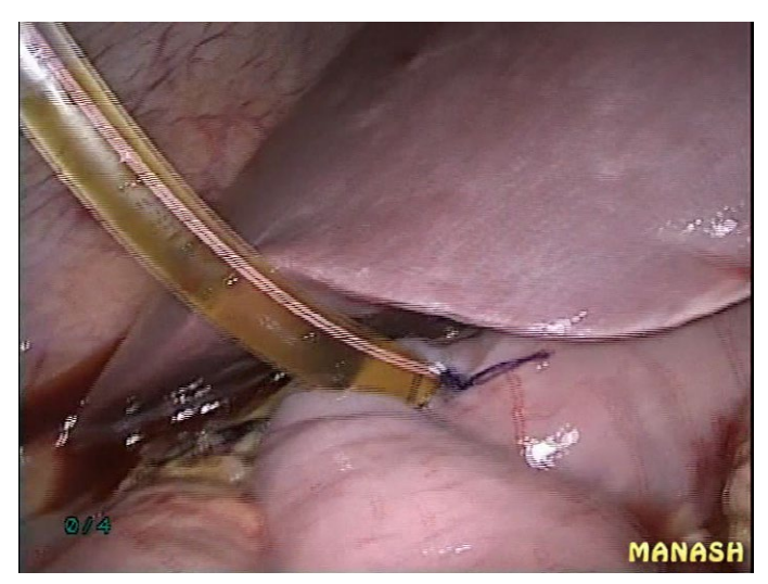
Figure 4. T-tube given across the hepaticojejunostomy as a stent.

Morbidity was greater in non T-tube group as leak occurred in two patients.