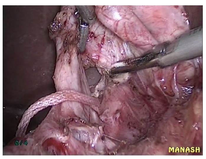
Figure 2. Cyst dissected off the portal vein.