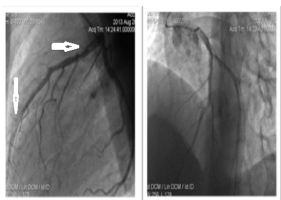
Figure 3. Panel A: a large thrombus burden grade 3 in the proximal left anterior descending (LAD) artery with dissection. Panel B and C: Circumflex and right coronary artery were angiographically normal.

disease, other than tobacco smoking, was admitted in our intensive care unit because of retrosternal chest pain for approximately 30 minutes. On physical examination, he was distressed and sweaty, his blood pressure was 120/60 mmHg. An electrocardiogram showed sinus rhythm and 2-3 mm ST-segment elevation on lead V1 to V5. He smoked cannabis cigar (the last consumption of cannabis was 10 h ago). The patient was immediately taken to the hemodynamic laboratory because of acute anterior myocardial infarction. Coronary angiography revealed a large thrombus burden grade 3 in the proximal left anterior descending (LAD) artery with dissection (Figure 3 Panel A). Circumflex and right coronary artery were angiographically normal (Figure 3 Panel B and C). Laboratory tests demonstrated a troponine peak of 2.23 \mu\text{g/L} ; other values were within limits.