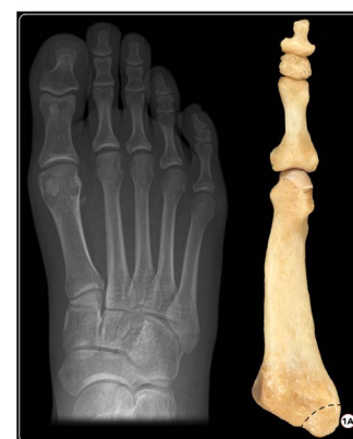
Figure 3. X-ray of a Type-1a fracture and correlation in bone model: fracture involving the lateral one-third metatarsal-cuboid joint