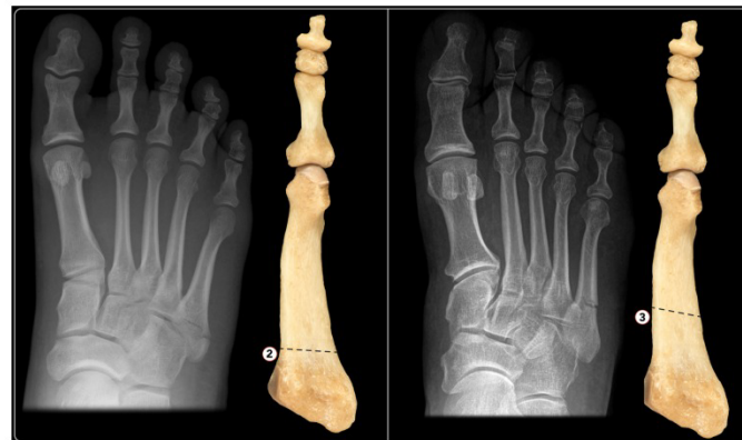
Figure 6. X-rays of Type-2 and Type-3 fractures and correlation in bone models: Type-2 (left): fractures at the junction between the proximal diaphysis and metaphysis of the fifth metatarsal (Jones fractures); Type-3 (right): fractures of the fifth metatarsal shaft (shaft stress fractures)

was defined as the absence of pinpoint tenderness on fracture site palpation and the patient's ability to bear weight on the involved foot without discomfort. Further, the following parameters were assessed: sport type and activity level (high level athletes training more than 14 hours per week; recreational athletes less than 14 hours per week), time until return to full weight bearing, to work and to sport activities.