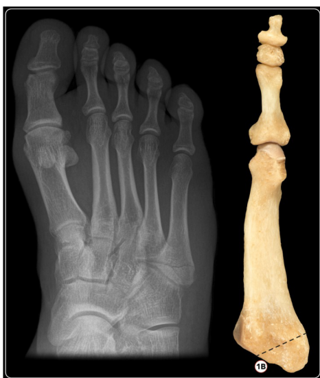
Figure 4. X-ray of a Type-1b fracture and correlation in bone model: fracture involving the middle one-third metatarsal-cuboid joint

First, clinical information, included complications, after early evaluation at a 4 to 6 weeks period was obtained for each participant. Second, at the time of this study, a phone contact was attempted for all patients, and a follow-up appointment was fixed. Patients who returned were examined by the second investigator (G.d.G), and clinical results were measured using the AOFAS Midfoot score [1]. Clinical healing