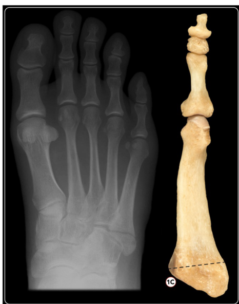
Figure 5. X-ray of a Type-1c fracture and correlation in bone model: fracture involving the medial one third metatarsal-cuboid joint