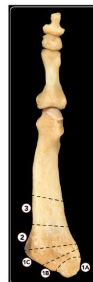
Figure 2. A 3-zone anatomical classification of 5MTB proximal part used during our analysis according to Mehlhorn, Lawrence and Botte studies. Zone-1a: including the lateral one-third metatarsal-cuboid joint; Zone-1b: including the middle one-third metatarsal-cuboid joint; Zone-1c: including the medial one third metatarsal-cuboid joint. Zone-2: including the junction between the proximal diaphysis and metaphysis of the fifth metatarsal. Zone-3: including the fifth metatarsal shaft

Type-1b: Fracture involving the middle one-third metatarsal-cuboid joint (Figure 4).