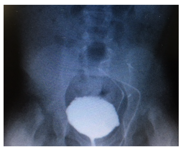
Figure 5. Control cistograma.