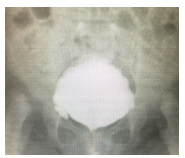
Figure 1. Neuropathic bladder.