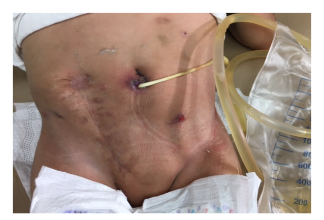
Figure 4. Ten days postoperatively.

Kaeffer and Retik reported an initial continence rate of 82% and ultimately 96%: Suze et al reported a 98% continence rate, our patient had continence after the procedure by the meticulous dissecting to