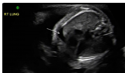
Figure 4. Right pleural effusion (arrow) at 27 weeks gestation.

one of the classic findings: hematuria, a palpable abdominal mass or thrombocytopenia [2].