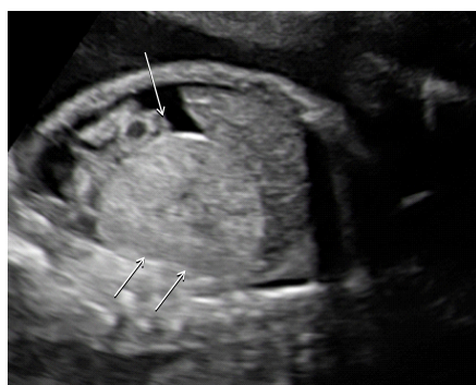
Figure 3. Abdominal ascites (arrow)and enlarged fetal right kidney (arrows) at 27 weeks gestation.

*IVC= Inferior Vena Cava, ** CD=Cesarean Delivery