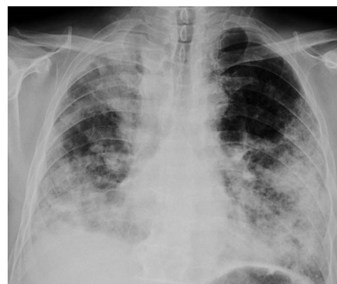
Figure 1. Direct PA chest radiograph showed new extensive patchy consolidations.