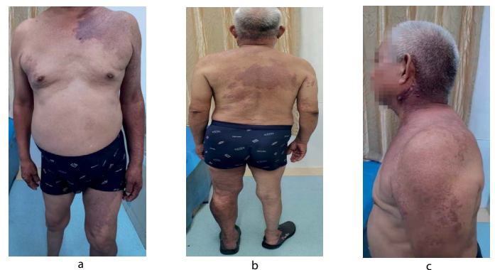
Figure 1: The patient's physical examination before operation showed a large area of wine stains on the left shoulder, back and inner thigh of the affected limb

Further examination reveals that the straightening angle of the left knee was only 20°, but the flexion angle can reach 100°. The right knee joint can be improved in terms of its functional ability. Extensor dorsalis muscle strength V of the left lower extremity was normal. The extensor dorsalis muscle strength IV of the right lower limb, the pulse of the dorsalis pedis artery of both lower limbs was good, and the ends of both lower limbs can feel, blood supply and activity. Radiological examination of the left knee shows severe degenerative osteoarthritis and hypertrophic square femoral condyle and subchondral bone