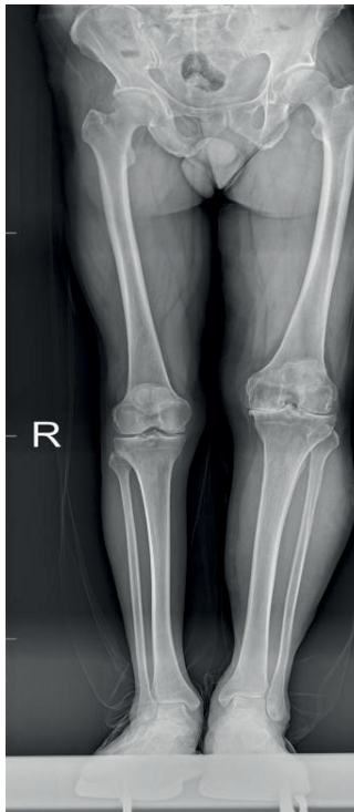
Figure 2: Preoperative X-ray showed severe degenerative osteoarthritis of the left knee, with hypertrophic and square femoral condyle and subchondral bone sclerosis

sclerosis (Figure 2). The preoperative coagulation index was high: plasma-d dimer: 0.63 \mu\text{g/mL} , plasma fibrinogen determination: 6.68 g/L, ESR: 81 mm/hr. Following consideration of the severe bleeding tendency of KT syndrome and the possibility of venous thrombosis, peripheral vascular doctors were consulted, and allogeneic blood 3U was arranged.