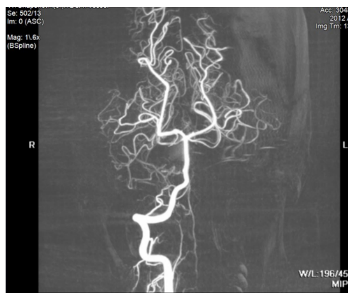
Figure 3. MR angiogram is unremarkable