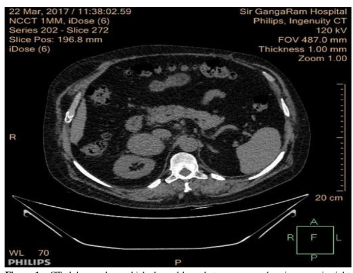
Figure 1a. CT abdomen done which showed large heterogenous enhancing mass in right suprarenal region measuring 6.5 \, \text{cm} \times 7 . 5 \, \text{cm} \times 8.3 \, \text{cm}

immunohistochemistry (IHC) revealed metastatic HCC with hep par positivity (Figure 2). His serum cortisol levels were normal. Further PET scan was done which showed FDG avid lesion in right supra renal region and no other FDG avid lesion elsewhere. This confirms diagnosis of isolated adrenal metastatic hepatocellular carcinoma (HCC). As disease was localized to adrenal with otherwise no lesion elsewhere, he underwent right adrenalectomy without any post-operative