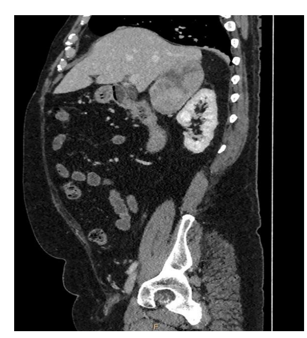
Figure 1b. CT abdomen with normal appearing post -transplant liver