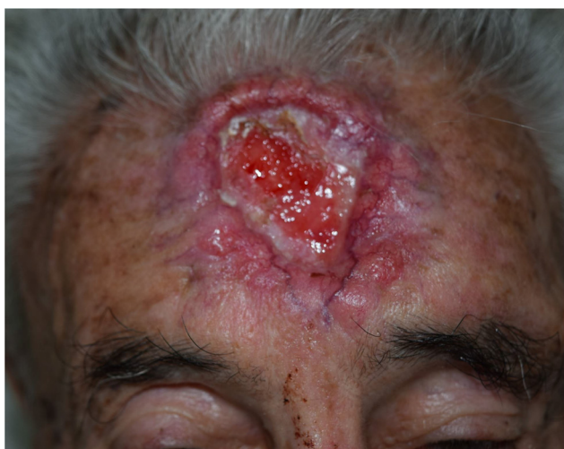
Figure 1. A huge metatypic bcc on the patient's forehead