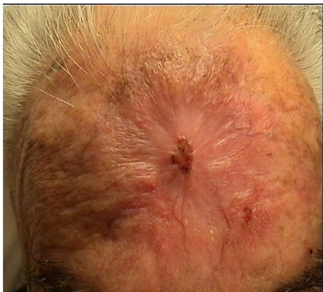
Figure 2. Clinical regression of the mass on the forehead after aloe treatment