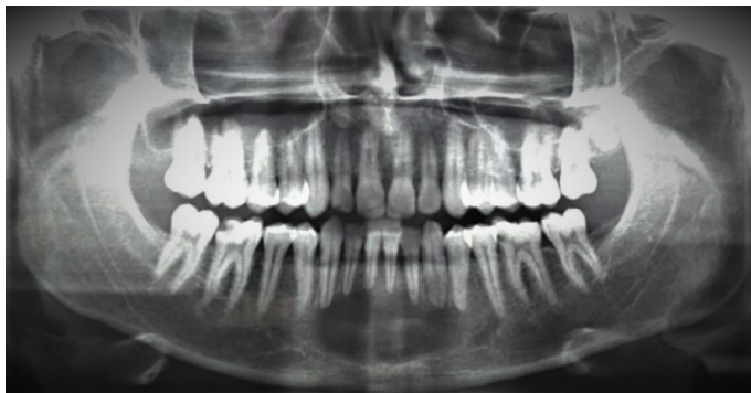
Figure 2. Orthopantomograph showing unilocular radiolucency extending from mandibular left first premolar to mandibular right first molar with superoinferior extension from root apices of the tooth to 2mm above the inferior alveolar nerve

Under Nasotracheal intubation general anesthesia was administered. Standard painting and draping was done. Intra oral betadine irrigation was done and local anesthesia was infiltrated along the vestibule of mandible (Figure 3). Crevicular incision was placed with vertical releasing incision in the molar region bilaterally. Mucoperiosteal flap was reflected to expose the underlying bone. Thinned buccal cortex was removed to expose the underlying lesion. The cyst was completely excised from the cavity and peripheral osteotomy was performed (Figure 4), which was then curetted and washed with betadine. Later the cavity was induced with blood to undergo spontaneous resolution and formation of new bone (Figure 5). The flaps were sutured with 3-0 vicryl. Patient was extubated and shifted to ICU uneventfully. The obtained specimen from the surgical site was sent for histopathological evaluation. Histology featured a thin inflamed connective tissue lining the cavity with chronic inflammatory cells and fibroblasts. It also had few bony fragments and osteocytes (Figure 6).