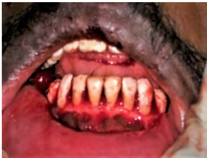
Figure 3. Clinical extent of lesion in the anterior mandible