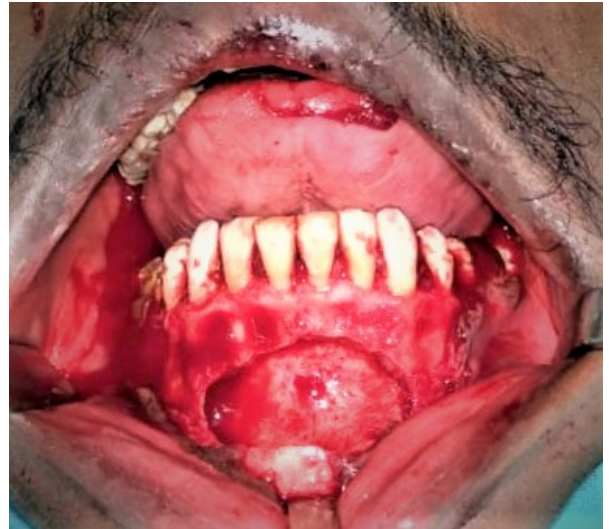
Figure 4. Elevation of mucoperiosteal flap, enucleation of cyst followed by peripheral osteotomy