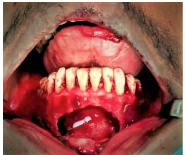
Figure 5. Bleeding induced within the cystic cavity to undergo spontaneous resolution and regeneration of new bone