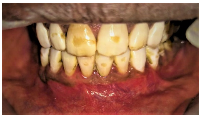
Figure 1. Intra oral view showing obliteration of buccal vestibule

Orthopantomograph (Figure 2) showed presence of a unilocular radiolucent lesion extending from the mandibular left first premolar to the mandibular right first molar. Superoinferiorly it extends from the root apices of the tooth to 2 mm above the inferior alveolar nerve. There was an empty aspiration initially and serous blood was obtained during second aspiration performed in different angulations. On the basis