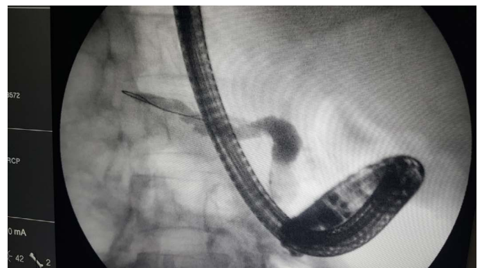
Figure 1. Pancreatogram showing dilated pancreatic duct with intraductal calculi. Proceeded with a wire basket extraction of PD stones.

Endoscopic balloon or basket retrieval is indicated in small, floating calculi which are <5 mm in size. Adequate pancreatic sphincterotomy is helpful before extraction [7].