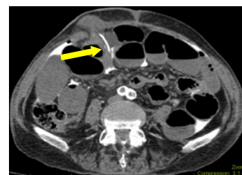
Figure 2. Axial image showing catheter's tip entering from subcutaneous plane into peritoneal cavity.

In addition, learning surgical radiology is of paramount importance for surgeons and regular feedback to radiologists may help to identify novel presentations of post operative complications after colorectal surgery.