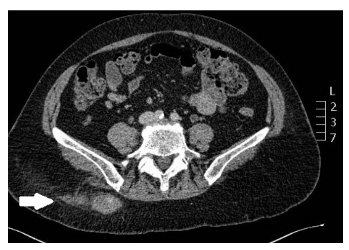
Figure 1. Computed tomography angiography: axial view of the lumbar artery pseudoaneurysm.