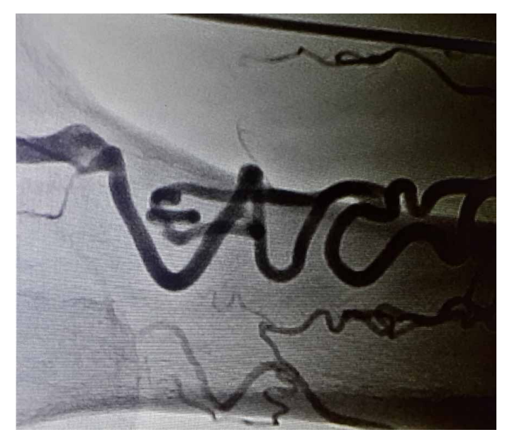
Figure 1. An angiographic view; a collateral artery is seen as a native bypass graft, developed as a result of angiogenesis due to hypoxic conditions in the limb. Note the course of this collateral artery with the excessive folds

These events bring new thinking or understanding about the hemodynamic principles of native bypassed grafts, collateral arteries developed due to angiogenesis. Is a native bypass graft better than a surgically bypassed graft? Does it have a longer patency rate? These questions need further investigations. But, there is another important question at this point: When should a surgeon make a decision for