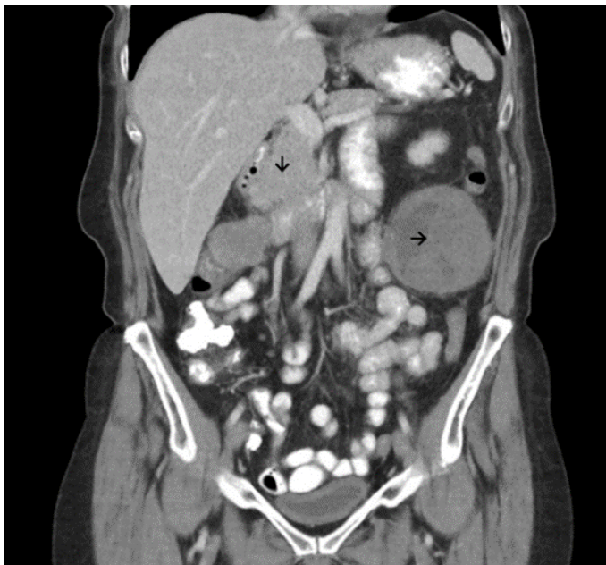
Figure 1. Coronal view of left retroperitoneal and paraduodenal mass

Our patient presented with rare sites of metastasis of phyllodes tumor into the retroperitoneal and intraperitoneal spaces, including involvement of the proximal transverse colon, mesentery, and duodenum. There are a limited number of reported cases of phyllodes