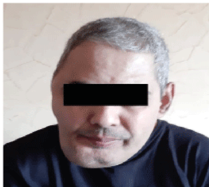
Figure 1. Swelling of the right mandibular region deforming the right hemiface

Physical examination revealed a large swelling measuring 6x8 cm (Figure 1), anteriorly extending from the right angle of the mandible to