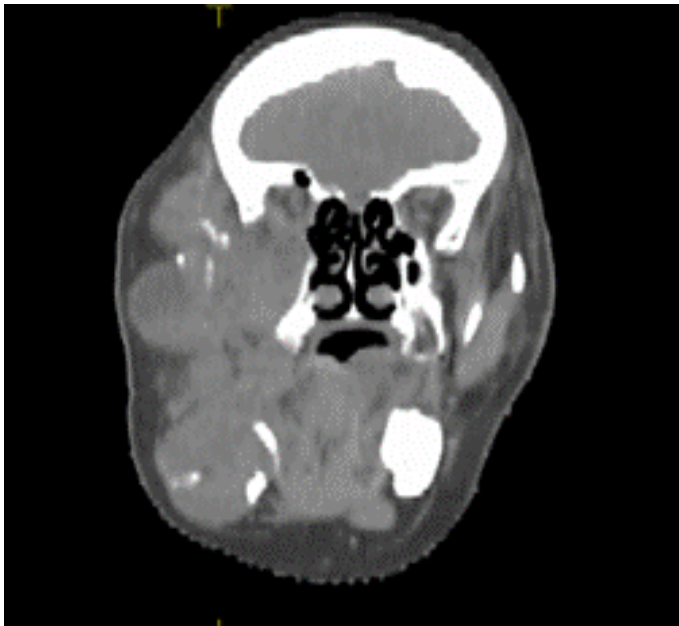
Figure 2. CT showing swelling in the right mandibular region deforming the right hemiface