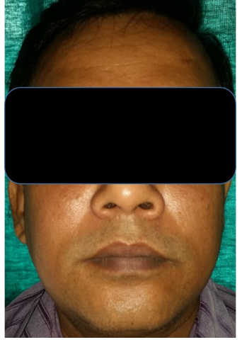
Figure 1. Pre-operative photo

A 45-year-old Indian male patient (Figure 1) was referred to our department with a chief complaint of pain swelling in the anterior mandible for the past 4 weeks. He gave a history of trauma to the chin 2 years back. Intraoral examination revealed obliteration of vestibule from 42 to 45 and swelling in 46 and 47 region (Figure 2). The swelling was soft and tender on palpation. The overlying mucosa was slightly inflamed. No pus discharge or ooze of any kind of fluid was observed. There was no sensory loss. Panoramic radiograph (Figure 3)