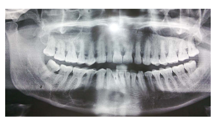
Figure 3. Pre-operative OPG

revealed multilocular radiolucency extending from 42 to 47, with displacement of roots of 43, 42, 41 and resorption of roots irt 43, 44, 45 was observed. A CT scan (Figures 4 and 5) showed resorption of buccal cortical plate in the posterior mandible. The provisional diagnosis of Ameloblastoma and keratocystic odontogenic tumor were considered. Aspiration yielded a serous brownish red colored fluid. An incisional biopsy revealed nonkeratinized stratified squamous epithelium lining with a flat interface with subsequent stroma. The epithelium shows plaque-like thickenings and whirling pattern of squamous epithelial cells. Other areas of epithelium showed pseudo-glandular pattern with few ciliated and mucus cells. Histopathology (Figures 6 and 7) was suggestive of glandular odontogenic cyst. Complete enucleation with removal of entire cystic lining and curettage were performed under General Anaesthesia (Figures 8 and 9). Primary closure was possible. Specimen was sent for histopathology, which again revealed glandular odontogenic cyst. One-year follow-up the case has revealed no recurrence.