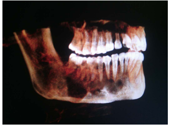
Figure 5. Pre-operative CT scan - Showing buccal cortex erosion