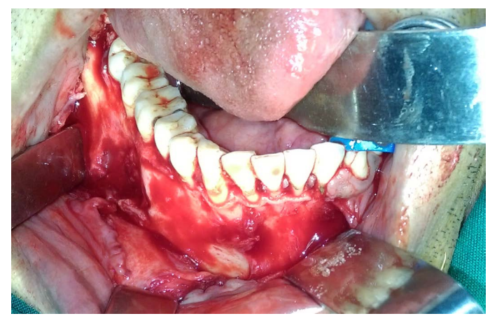
Figure 8. Intra operative defect after enucleation