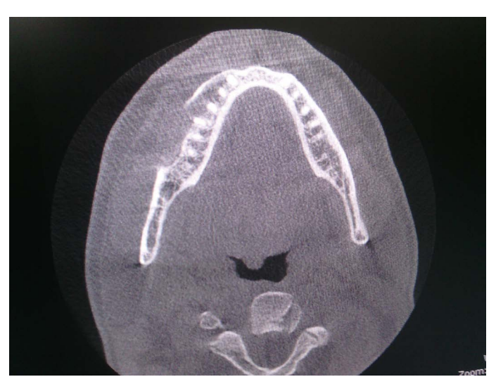
Figure 4. Pre-operative CT scan

GOC may mimic a wide clinicopathologic spectrum ranging from lateral periodontal cyst to a destructive malignant neoplasm such as Central Mucoepidermoid Carcinoma. There is a slight male predilection and commonly seen in middle age group and more predilection in mandible than maxilla was observed. Radiographic appearance is nonspecific. Radiographically, the GOC is localized intraosseously and may appear as a multilocular or unilocular radiolucent lesion with well-defined borders. Sometimes it may present with peripheral osteosclerotic border and scalloping, root resorption and displacement of the teeth. The clinical and radiographic findings of GOC are varied