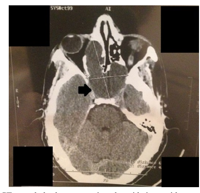
Figure 1. Axial CT revealed a large mass in sphenoid sinus with extension into the right ethmoidal with marked thinning of the internal wall of the orbit.

Introduction: In 1872, Rouge identified the first case of sphenoid sinus mucocele and later described by Berg in 1889 [2]. Mucoceles are benign lesions, expansile and locally destructive, causing erosions of the bony walls of the sinus [3]. Approximately two-thirds of all mucoceles are commonly found in the frontal sinuses, and the majority of the remainder involves the ethmoidal sinus [4,5]. The aetiology of sphenoid sinus mucocele is still unknown. Proposed theories for development of mucocele include cystic dilatation of the glandular structures and cystic development of embryonic epithelial residues [6,7]. Furthermore, Trauma and chronic inflammation (polypoid sinusitis) are considered to be causes of mucocele formation [8,9]. In the literature, some authors