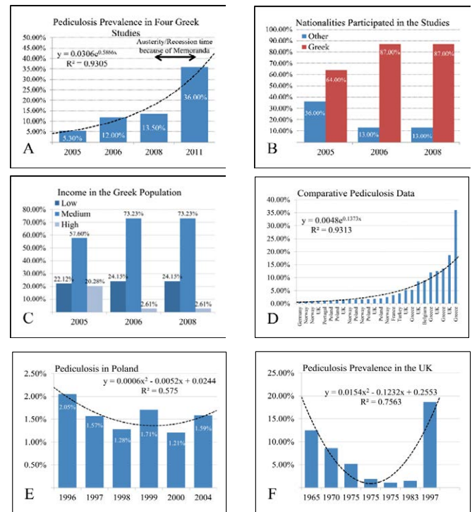
Figure 2. Comparative data from Greek and other studies with respect to pediculosis. Pediculosis percentages in four studies in respectively as much Greek studies (A). Comparison of three studies in Greece with respect to nationality of participants (B). Comparison of three studies in Greece with respect to income of participants (C). Comparison of pediculosis between countries in equal studies from respective countries (D). Time series of pediculosis in Poland (E). Time series of pediculosis in the UK (F).

Pediculosis in the general population follows polynomial dynamics, while in the percentages of couples, which have children with pediculosis the dynamics become linear ( R^2=1 ). This is a strong indicator, also mentioned before in the literature, that impoverishment enhances lice infestation. This can be explained by the fact that poor