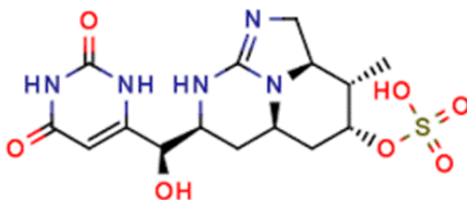
Figure 1. Section of the cyindrospermopsin

Lattice vibrations are usually seen at the range of 0-850 cm -1 . These modes are induced by rotary and transferring vibrations of molecules and vibrations and are including Hydrogen bond. Bands with low wavenumbers of Hydrogen bond vibrations in FT-IR and Raman spectrum (Figure 2) are frequently weak, width and unsymmetrical. Rotary lattice vibrations are frequently stronger than transferring ones. Intra-molecular vibrations with low wavenumbers involving two-bands O-H ...O dimer at 78 cm -1 , 183 cm -1 and 239 cm -1 are attributed to a rotary moving of two molecules involving in-plane rotation of molecules against each other.