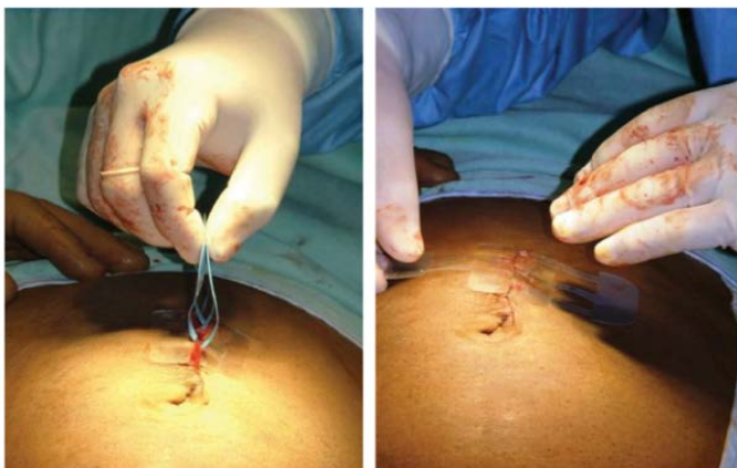
Figure 1. Application of the ClozeX ® System ®