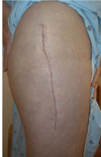
Figure 3. Healing Surgical Wound after ClozeX® Application in Hip Surgery a

This orthopedic surgeon used two (2) 60mm ClozeX devices to close the distal half of the incision and staples to close the proximal portion. Staples and ClozeX devices were removed at 10 days. The photo was taken at device removal at 3 weeks S/P. The surgeon employed standard suturing of the subcutaneous layer beneath both staple and ClozeX-treated wound segments.