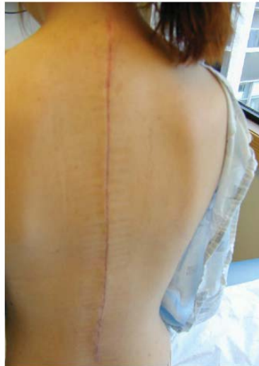
Figure 4. Healing Surgical Wound after ClozeX® Application in Spine Surgery a

Note: Experienced surgeons are closing incisions of this length with ClozeX in 5 minutes.